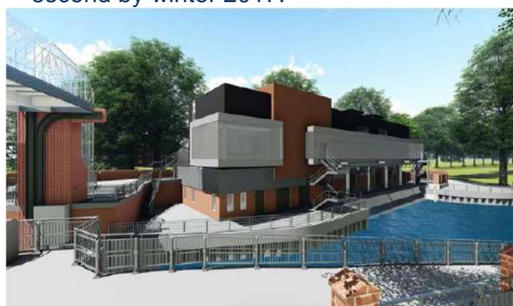
Artists impression of upgraded Foss Barrier

Since December 2015, we have committed to spend £17 million improving the Foss Barrier. We have installed 8 new pumps, with a pumping capacity of approximately 40 cubic metres per second (equivalent to the flow down the Foss on Boxing Day 2015). We are now progressing with the permanent works, including adding an additional storey to the building to house sensitive equipment. These works will improve the power supply to the pumps, increasing the pumping capacity to 50 cubic metres per second by winter 2017.