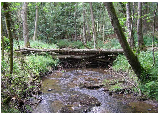
Example of a woody debris dam

Swale, Ure and Nidd which will also benefit all the communities on these rivers and the Ouse. The will focus on natural flood management measures where possible.