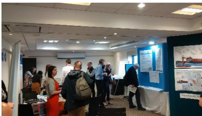
Residents viewing the exhibition

We were overwhelmed by the public response to our public exhibition on 25-26