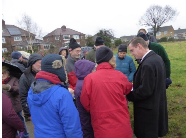
Residents and EA staff discussing proposals on Hob Moor

Since the exhibition we have been in contact with many residents keen to know more about how options in the 5 Year Plan may affect them. In most areas residents are in favour of improved defences, but some communities have raised concerns. We have been clear that the 5 Year Plan provided outline options, but we will not pursue schemes where the community is not supportive of this.