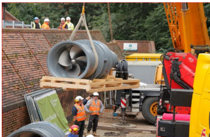
New pump at Foss Barrier

Since December 2015, we have committed to spend £17 million improving the Foss Barrier. We have installed 8 new pumps, with a pumping capacity of approximately 40 cubic metres per second (equivalent to the flow down the Foss on Boxing Day 2015). We are now progressing with the permanent works, including adding an additional storey to the building to house sensitive equipment. These works will improve the power supply to the pumps, increasing the pumping capacity to 50 cubic metres per second by winter 2017.